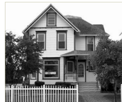
JEFFERSON MANOR WILL OPEN IN SEPTEMBER